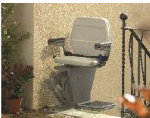
5. When you are not using your 320, you can leave it in its swivelled position to act as a barrier