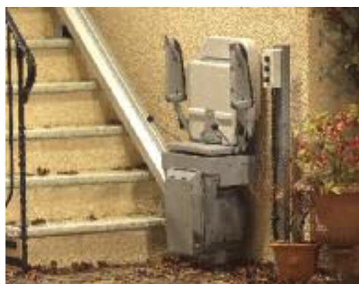
6. Your 320 can be folded flat when it's not in use, giving more space on your stairs for other stair users