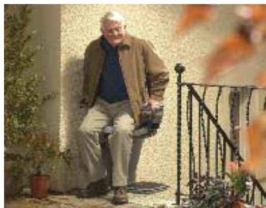
4. When you arrive at the top of the stairs, you can swivel your 320 around so you can get off safely