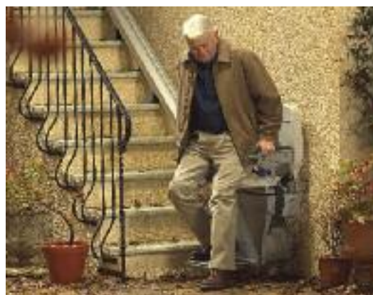
2. Once unfolded, make yourself comfortable in the seat. Fasten the seatbelt for additional security