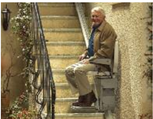
3. A gentle movement of the joystick is all it takes to make your 320 glide effortlessly upstairs