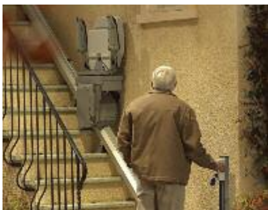
1. Using the optional call station, you can send and receive your 320 to either end of the stairs

We believe a stairlift should go beyond the functional to become a seamless part of a more rewarding life. To us, that means making it beautifully simple to operate, whatever the weather.