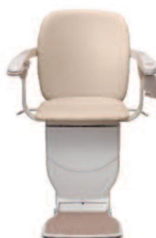
Model Shown - Siena for straight stairs in Ivory vinyl upholstery

Two chair widths - a standard arm width and a new XL arm width version tailored to the user and their staircase. (Standard width shown opposite - XL version shown below).