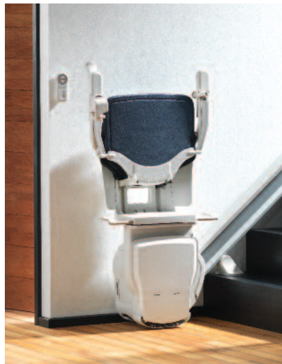
1. Your Solus can be folded flat against the wall when it's not in use, giving you more space.

We believe a stairlift should go beyond the functional. To us, that means making it beautifully simple to operate.