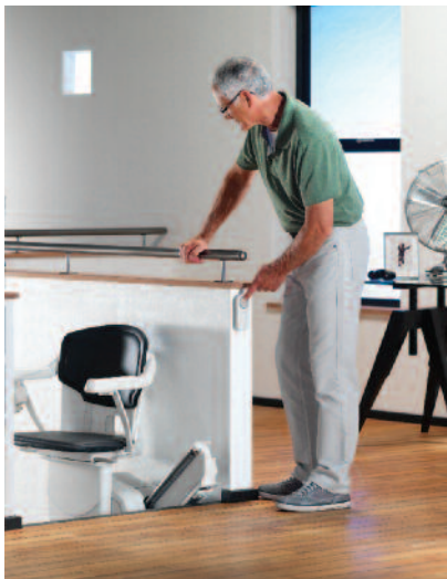
6. Using the wall-mounted remote control, you can send and receive your Solus to either end of the stairs.