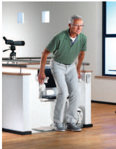
4. When you arrive at the top of the stairs, you can swivel your Solus around so you can get off safely.