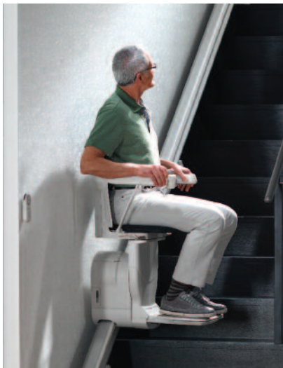
3. A gentle movement of the controls is all it takes to make your Solus glide effortlessly upstairs or downstairs.