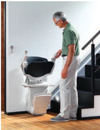
2. To unfold your Solus, just lower the arms or the seat and the footrest unfolds too.