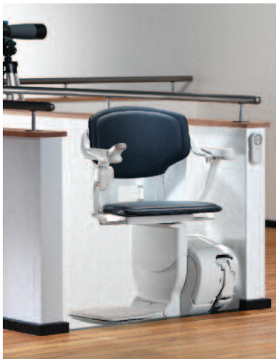
5. When not in use your Solus can be left in the swivelled position as a safety barrier, or fold it flat against the wall.