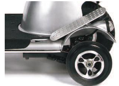
Quintell™ Adaptive Footplates Adjustable to match your measurements