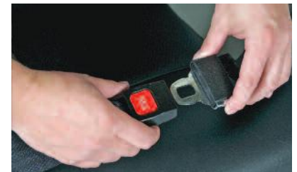
Quick release seat belt Adjustable to match your measurements