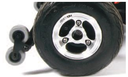
Quintell™ Kerbmaster™ Anti-tipping / Powered Anti-grounding