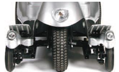
Quintell™ Self Centering Steering Defaults to straight travel with minimal effort