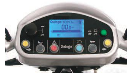
Multi-feature digital dash/LCD display Easy to read layout and controls