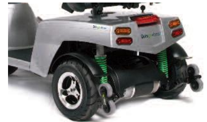
Long Travel Suspension & Kerbmaster Anti-grounding & Anti-tipping Smoother and safer journeys with style