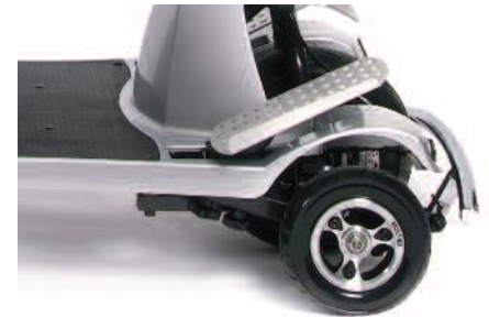
Quintell™ Adaptive Footplates Adjustable to match your measurements